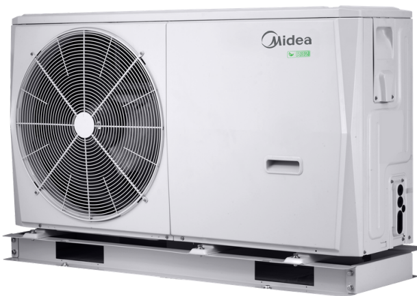
MHC-V4 & MHC-V6