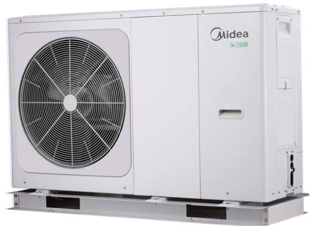
MHC-V8 - MHC-V16